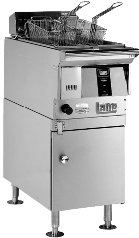
Model 130F-BASE-M shown