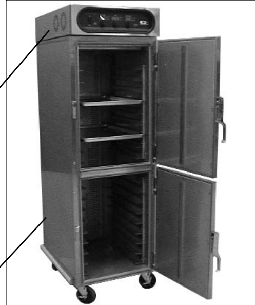
CH18 (shown with optional side bumpers)

ALL STAINLESS STEEL CONSTRUCTION... Welded, turned-in seam construction for long durable life and ease of cleaning and safety.