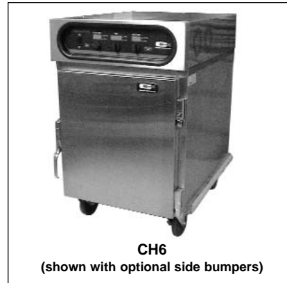
CH6 (shown with optional side bumpers)

EASY-TO-USE DIGITAL CONTROLS... Control cooking and holding with separate dial controls and digital display. Temperature range of 100°F to 200°F for hold cycle and 100°F to 325°F for cook cycle. Eighteen hour timer counts down in cook cycle. When cook cycle is over, cabinet automatically switches to hold cycle and timer counts up.