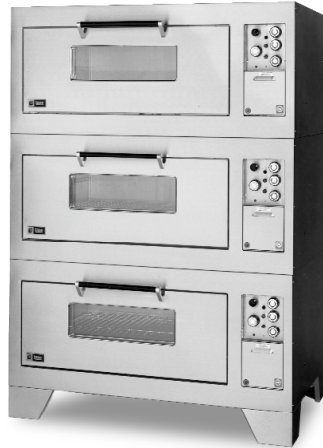
Model D054B3M shown