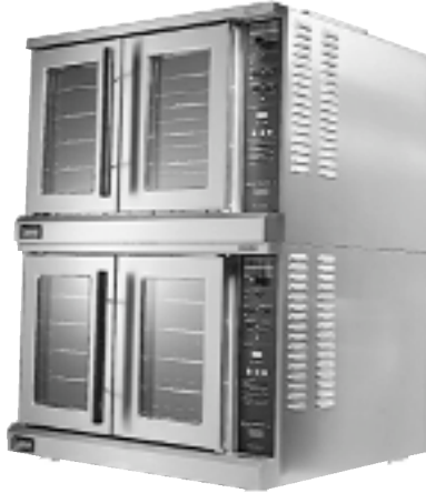
Model ECOF-S2M shown