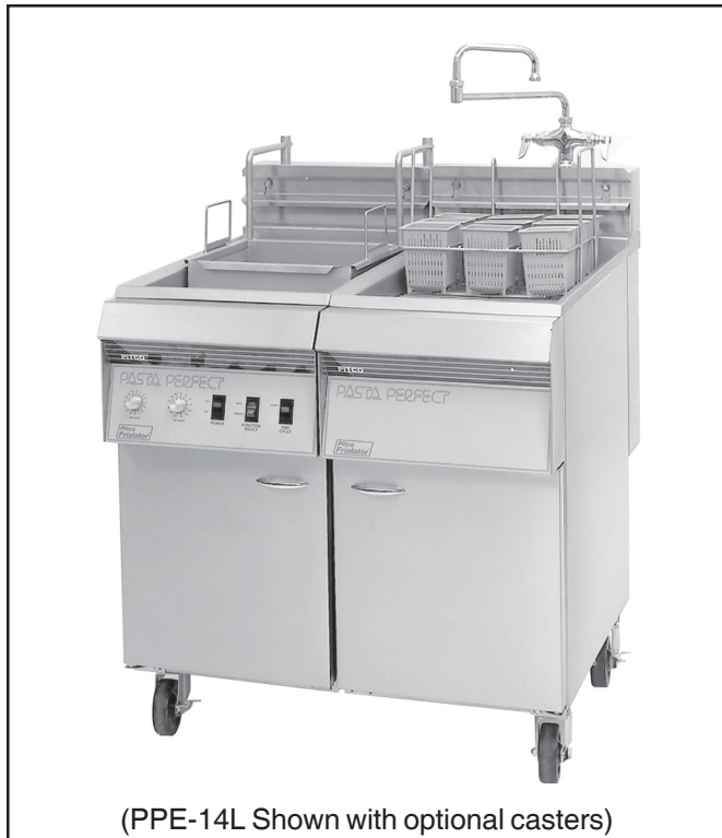
(PPE-14L Shown with optional casters)