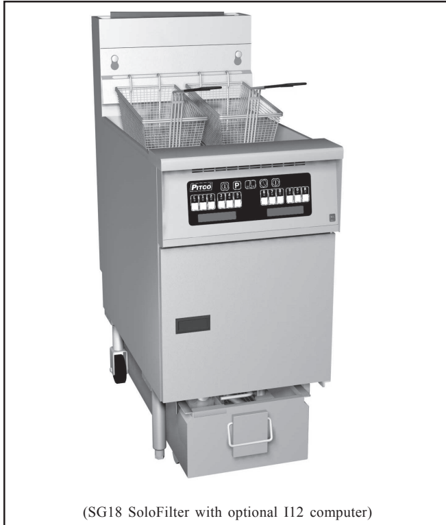
(SG18 SoloFilter with optional I12 computer)