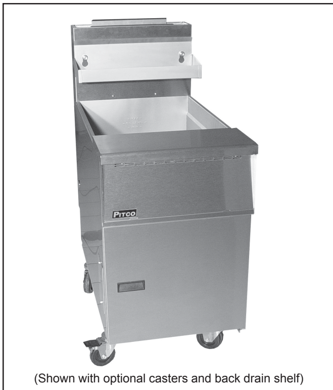
(Shown with optional casters and back drain shelf)