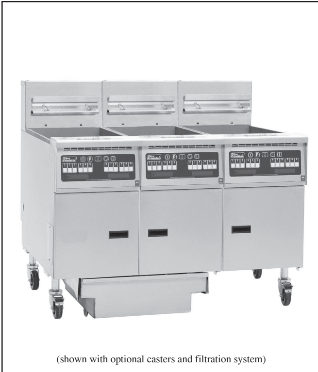
(shown with optional casters and filtration system)