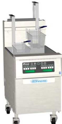
SSH75 with optional Computer, Basket Lift and casters